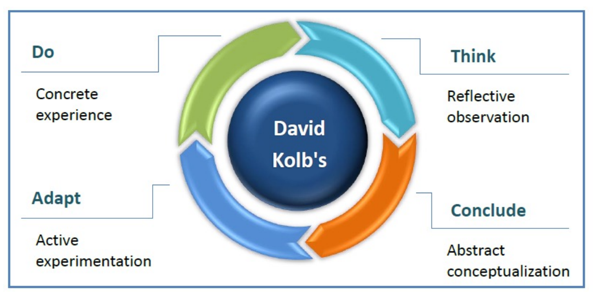
Figure 12: David Kolb's learning styles model